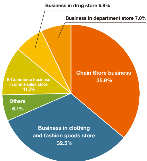
Sales ratio by channel in FY 2017