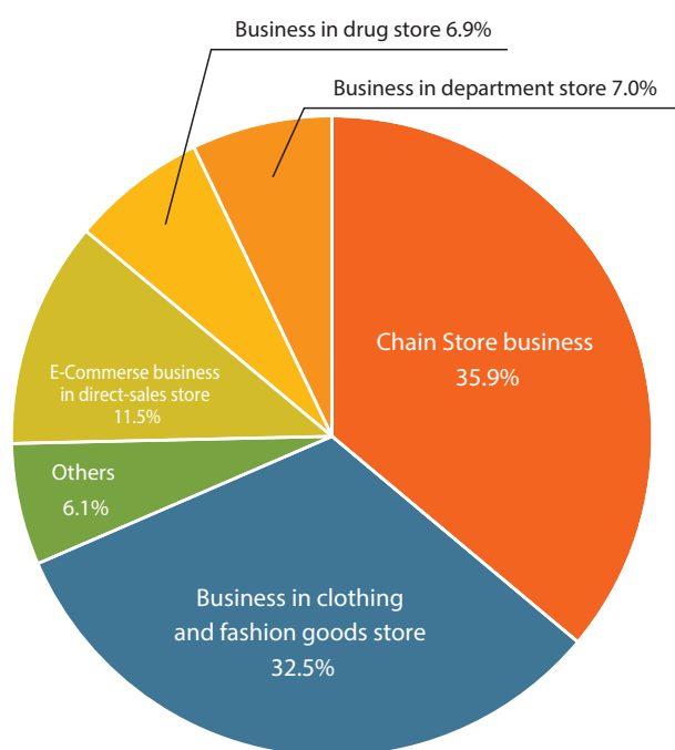
Sales ratio by channel in FY 2017